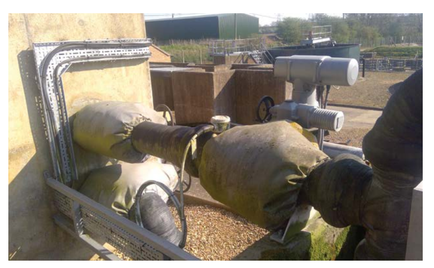
Figure 1 Poorly installed flow to full treatment flow meter.