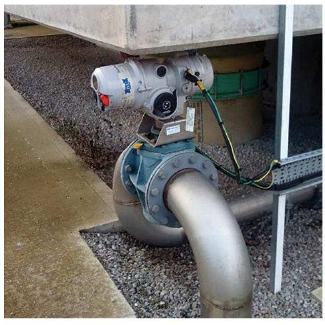
Figure 3 – Poor installation can breed poor maintenance. This control valve, installed underneath a raised tank, is not accessible for maintenance purposes.

flow figures decreased by 22%. Poor maintenance, as in Figure 2, can be exacerbated by poor installation (Figure 3). Instrumentation and automation equipment need to be accessible for maintenance purpose. If there are accessibility issues for practical (i.e. cannot be reached easily) and/or health and safety reasons, then the equipment simply will not get maintained and will eventually stop working.