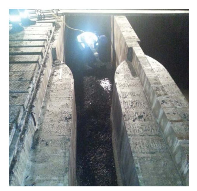
Figure 2: A large flume influenced by poor maintenance procedures allowing grit build up.